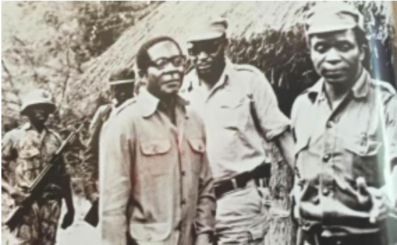
Image on the right: Zimbabwe ZANU-PF leaders Robert Mugabe and Emmerson Mnangagwa in Mozambique during the late 1970s.

The Zimbabwe African National Union Patriotic Front (ZANU-PF) remains in power nearly four decades after independence in April 1980. Zimbabwe has been a staunch pillar of the regional SADC and the AU particularly in reference to the support shown for national liberation movements which came after Harare and the ongoing struggle to free the Western Sahara, the Saharawi Arab Democratic Republic (SADR), the last remaining contested zone in Africa.