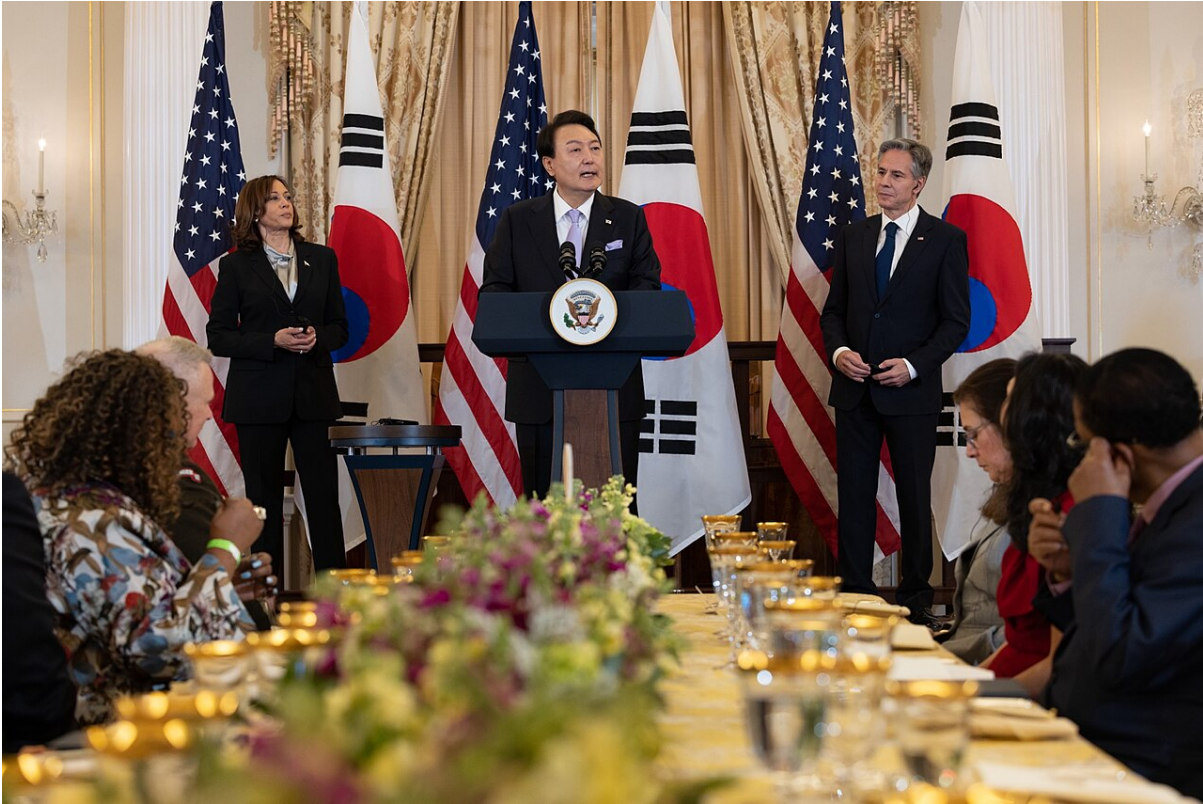
US Secretary of State Blinken and Vice President Harris host a state dinner for Yoon, April 2023.