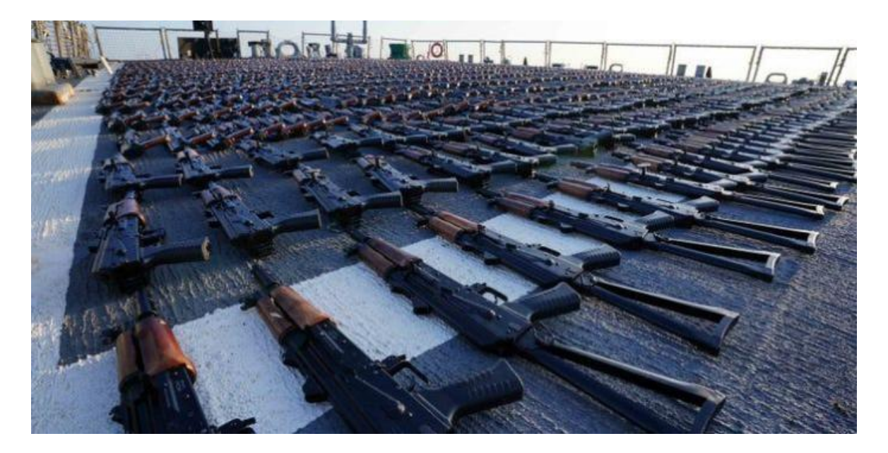
Iranian rifles destined for Yemen seized by U.S. naval vessel.

Although actual critics of the attack on Yemen, on non-propaganda and principal terms, had no access to the press, the major journals lended themselves open to Saudi generals explaining that "Saudi Arabia's stance on protecting Yemen's sovereignty remains unequivocal...It is imperative for Saudi Arabia to preserve peace in Yemen." Therefore, "It is a war of necessity, not a war of choice for the Saudis." What is shocking is not that it was published (that is to be expected), but rather that it elicited no reaction of utter contempt