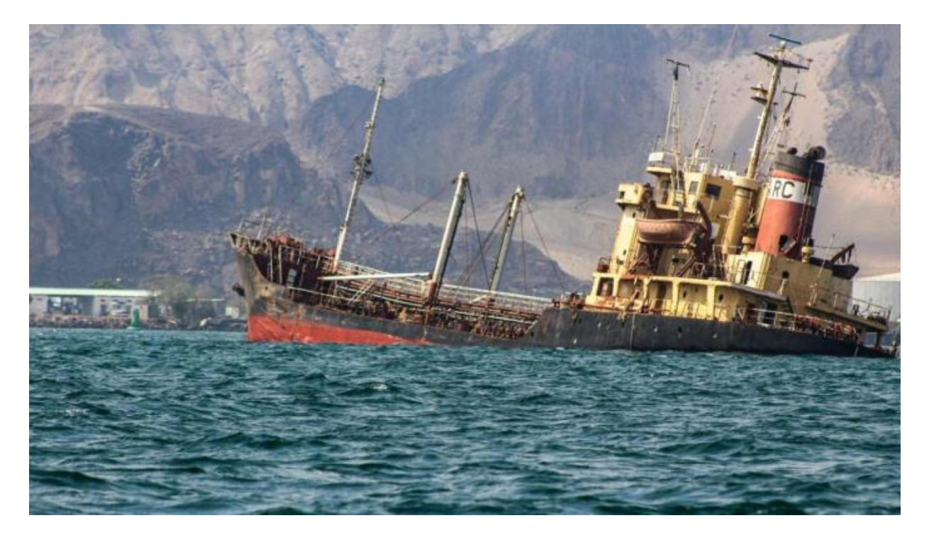
Yemeni oil ship seized by Saudis.

record of Coalition-seized Yemeni oil ships, totaling billions of dollars in value.<sup>[34]</sup>