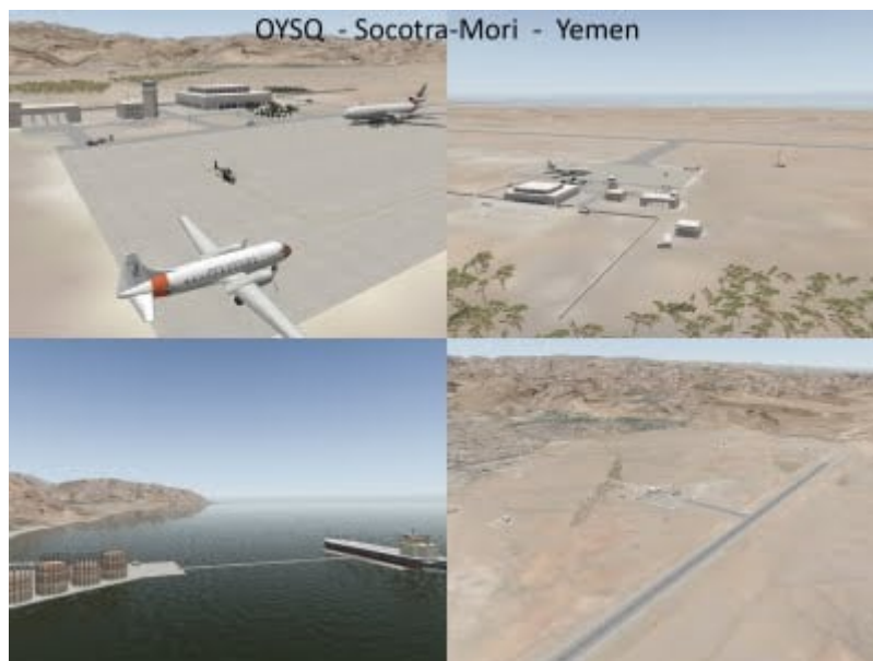
Existing runway and airport

“Among the new programs, Saleh and Petraeus agreed to allow the use of American aircraft, perhaps drones, as well as “seaborne missiles”-as long as the operations have prior approval from the Yemenis, according to a senior Yemeni official who requested anonymity when speaking about sensitive subjects. U.S. officials say the island of Socotra, 200 miles off the Yemeni coast, will be beefed up from a small airstrip [under the jurisdiction of the Yemeni military] to a full base in order to support the larger aid program as well as battle Somali pirates. Petraeus is also trying to provide the Yemeni forces with basic equipment such as up-armored Humvees and possibly more helicopters.” (Newsweek, Newsweek, January 18, 2010, emphasis added)