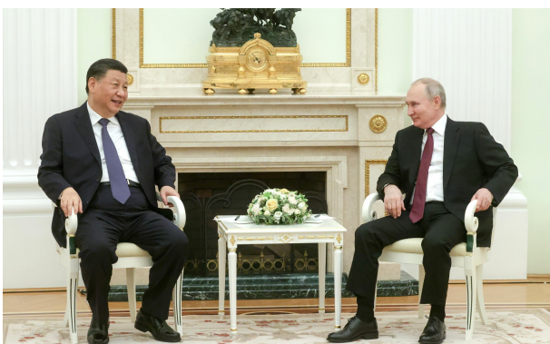
Image: With President of the People’s Republic of China Xi Jinping.

Russia lost the members of the Warsaw Pact; its economy was down; the leaders under Boris Yeltsin were corrupt; and Russia’s international influence was almost wiped out.