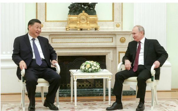
Image: With President of the People’s Republic of China Xi Jinping.

Russia lost the members of the Warsaw Pact; its economy was down; the leaders under Boris Yeltsin were corrupt; and Russia’s international influence was almost wiped out.