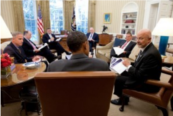
Image: Director of National Intelligence James Clapper (right) talks with President Barack Obama in the Oval Office, with John Brennan and other national security aides present.

Obama also got help from Russian President Vladimir Putin who persuaded President Assad to surrender all his chemical weapons (while Assad still denied any role in the sarin-gas attack). Putin's assistance infuriated the neocons who soon recognized that the Obama-Putin cooperation was a profound threat to their "regime change" enterprise.