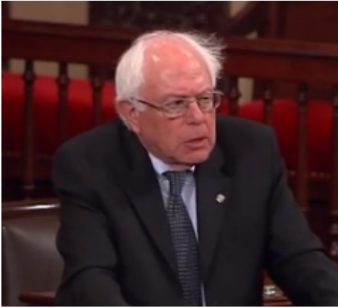
Sen. Bernie Sanders of Vermont, who is seeking the Democratic presidential nomination.

If she gets the Democratic nomination, she may have little choice but to engage in a fiercely negative campaign since — faced with the lack of voter enthusiasm — her best chance of winning is to so demonize her Republican opponent that Democrats and independents will be driven to the polls out of fear of what the crazy GOP madman might do.