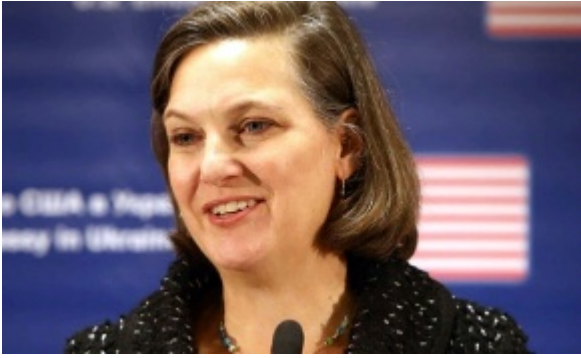
Image: Assistant Secretary of State for European and Eurasian Affairs Victoria Nuland during a press conference at the U.S. Embassy in Kiev, Ukraine, on Feb. 7, 2014.

The behind-the-scenes neocon influence became especially pronounced at Clinton's State Department where she tapped the likes of Nuland, a neocon ideologue and an adviser to Vice President Dick Cheney, to become the department's spokesperson and put her on track to become Assistant Secretary of State for European Affairs (although the appointment wasn't finalized until after Clinton left in 2013).