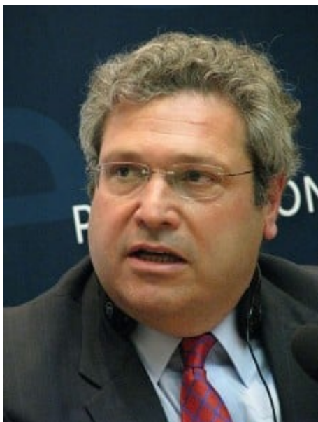
Image: Prominent neocon intellectual Robert Kagan.

So, Clinton’s election could mean that some of the most dangerous people in American foreign policy would be whispering their schemes for war and more war directly into her ear – and her record shows that she is very susceptible to such guidance.