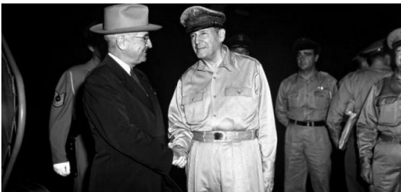
Image: Truman and MacArthur, 1950

The criminal bombings of Pyongyang in 1951 ordered by president Truman, had been opposed by General Douglas MacArthur who was commander of allied forces in Korea: