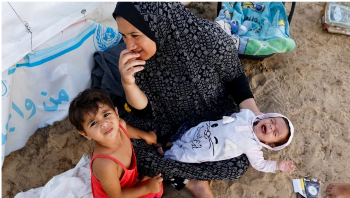
A woman and her children, who fled their homes amid Israeli air strikes, take shelter at a tent camp at a United Nations-run centre in Khan Younis in the southern Gaza Strip on Monday.