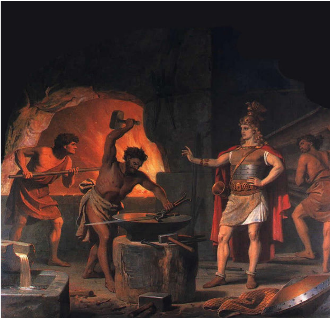
Siegfried at Regin's forge to receive the sword he will use to slay Fafnir the dragon in Richard Wagner's cycle Ring of the Nibelung : Painting 1880 by Wilhelm Ernst Ferdinand Franz Hauschild (1827-1887), Neuschwanstein Castle collection

When citing German culture, we return to Richard Wagner, creator of The Ring of the Nibelung , the great 19 th century prophecy of the coming of the modern age in which Wagner depicts allegorically the travails through which humanity must pass to achieve its promised future. The Empire has been trying in vain to block this future from arising, as such a future has no place for the exploitation of humanity.