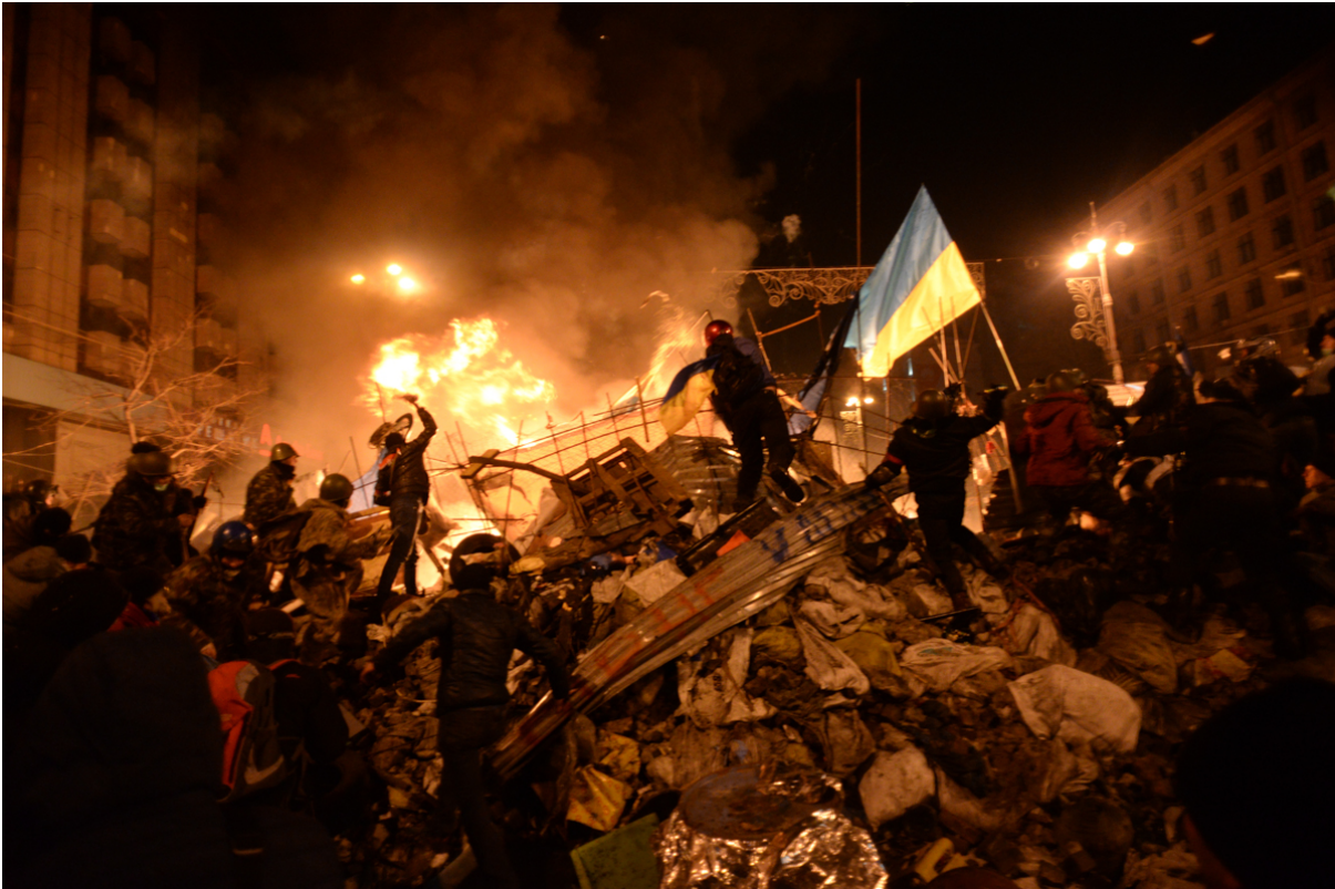
State flag of Ukraine behind a wall of anonymous protesters in Kyiv, Ukraine. Events of February 18, 2014

Actually, the rivalry with Russia dates to the British "great game," where Britain saw the expanding Russian Empire as endangering British hegemony in the Middle East and India. Napoleon tried to harness Russia in his own series of wars against Britain, an attempt which failed. The bitterly-fought Crimean War of 1853-1856 saw Russia's southward expansion thwarted by a coalition of Britain, France, Piedmont-Sardinia and the Ottoman Empire, but Russia recovered quickly and was able to send its fleet to New York and San Francisco as a show of strength in support of the Union during the American Civil War.