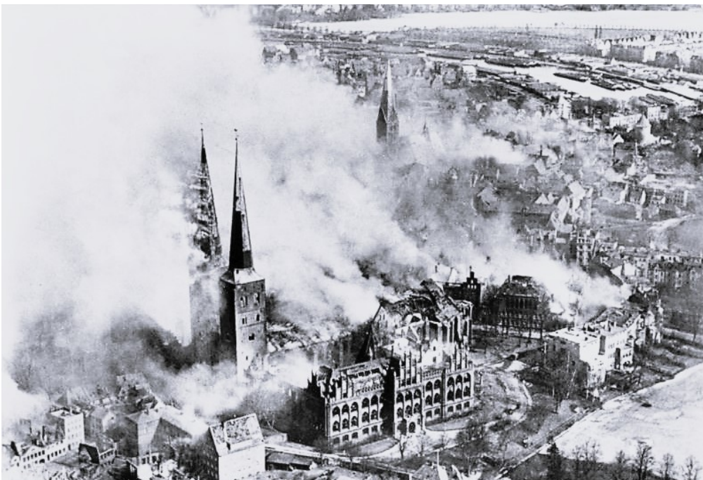
Lübeck Cathedral burning following the raids

"Bomber" Harris was satisfied with the destruction, saying Lubeck "was built more like a fire-lighter than a human habitation... it seemed to me better to destroy an industrial town of moderate importance [Lubeck] than to fail to destroy a large industrial city".