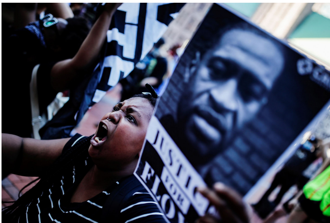
Mass demonstrations opposing United States racist killings

Another protest was held in Copenhagen, Denmark where people gathered at the U.S. embassy saying “Stop Killing Black People.” Berlin, Germany was the scene of a demonstration on May 30 where protesters rallied outside the U.S. embassy and later marched through the Kruzberg area of the city. Activists advanced slogans such as “Silence is Violence,” “Hold Cops Accountable,” and “Who Do You Call When Police Murder?”