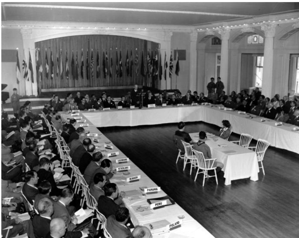
1944 Bretton Woods conference.

From its founding at the 1944 Bretton Woods conference, the World Bank has served mostly U.S. government’s interests, attaching conditions to loans that forced foreign governments to privatize their economies and privilege foreign investors.