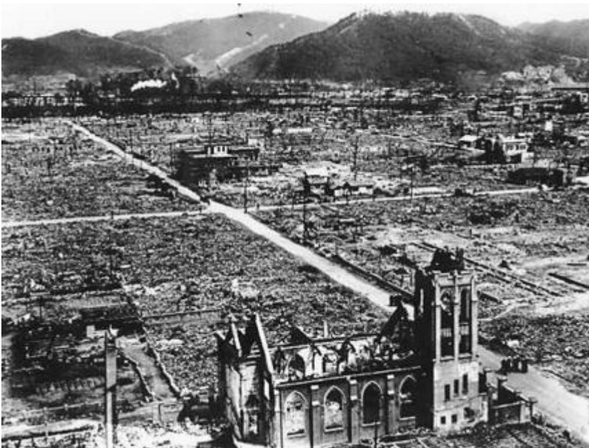
Hiroshima in the wake of the atomic bomb attack, 6 August 1945

One single atomic bomb dropped on Hiroshima resulted in the immediate death of 100,000 people in the first seven seconds. Imagine what would have happened if 204 atomic bombs had been dropped on major cities of the Soviet Union as outlined in a secret U.S. plan formulated during the Second World War .