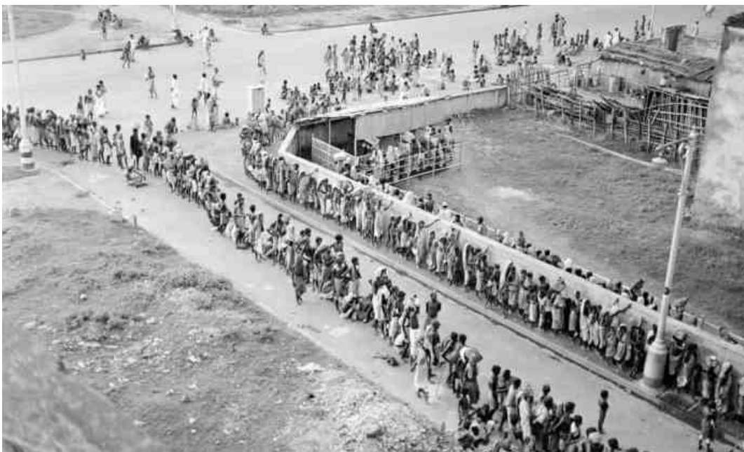
Indian citizens waiting in line at a soup kitchen.

Researchers in India and the US used weather data to simulate the amount of moisture in the soil during six major famines in the subcontinent between 1873 and 1943. Soil moisture deficits, brought about by poor rainfall and high temperatures, are a key indicator of drought.