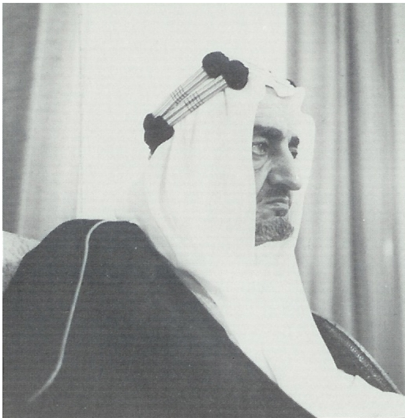
King Faisal at Jeddah, 1965