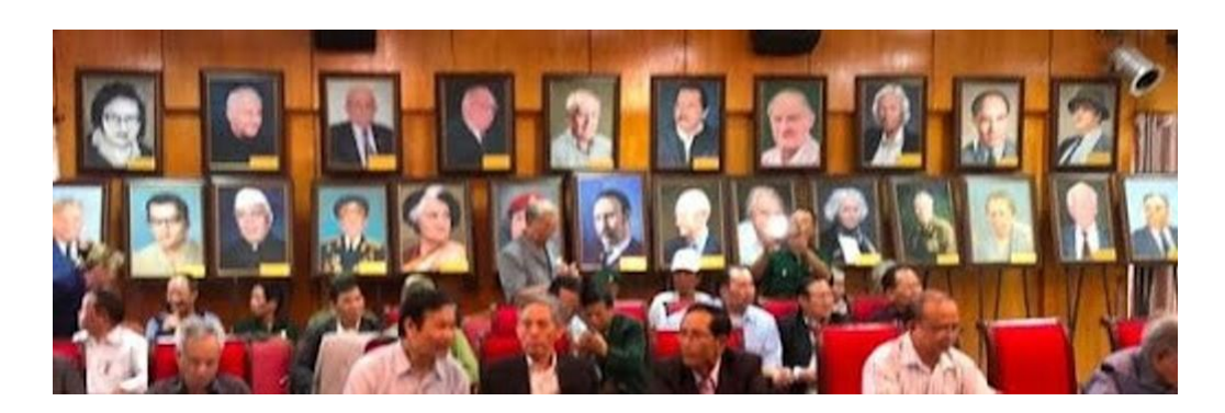
Portraits displayed in the Friendship Society Building in Hanoii, Vietnam.

I didn't, until our VFP delegation saw the portraits displayed of five Americans who gave their lives to protest the American war on Vietnam, among other international persons who are revered in Vietnamese history, at the Vietnam-USA Friendship Society in Hanoi. Though these American peace persons have fallen into oblivion in their own nation, they are well-known martyrs in Vietnam, 50 years later.