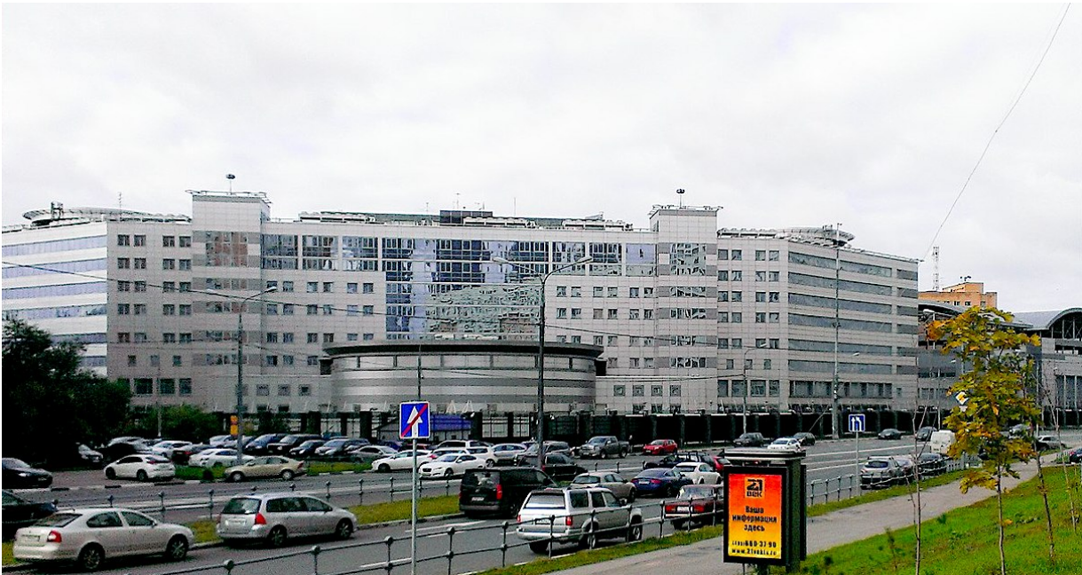
Russian military intelligence (GRU) headquarters, Moscow.

What we are witnessing in Ukraine today is how this money has changed the game. The result is more dead Ukrainian and Russian forces, more dead civilians, and more destroyed equipment.