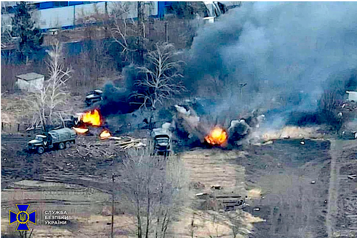
Russian military vehicles bombed by Ukrainian forces, March 8, 2022.

War is a complicated business. Applebaum seems ignorant of this. Both the Ukrainian and Russian militaries are large, professional organizations backed by institutions designed to produce qualified warriors. Both militaries are well led, well equipped, and well prepared to undertake the missions assigned them. They are among the largest military organizations in Europe.