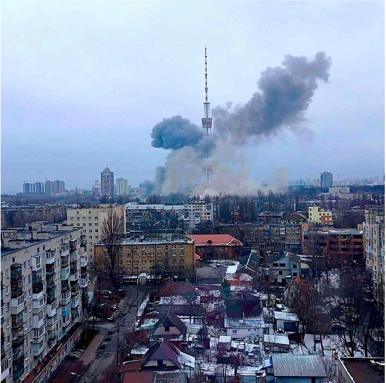
Russian bombardment of telecommunications antennas in Kiev, March 1, 2022.

On March 25, the head of the Main Operational Directorate of the General Staff of the Armed Forces of the Russian Federation, Colonel General Sergei Rudskoy, gave a briefing in which he announced the end of what he called Phase One of Russia's "special military operation" (SMO) in Ukraine.