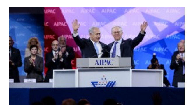
Israeli Prime Minister Benjamin Netanyahu at AIPAC conference in Washington, D.C., on March 4, 2014.

During the 2008 campaign, then-Sen. Barack Obama , whom Netanyahu viewed with suspicion, traveled to Israel to demonstrate sympathy for Israelis within rocket-range of Gaza while steering clear of showing much empathy for the Palestinians.