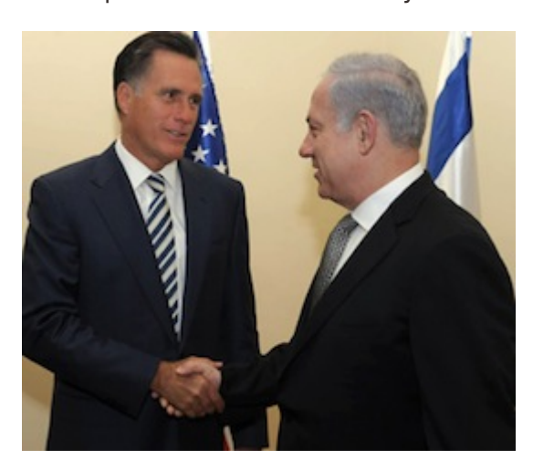
Republican presidential candidate Mitt Romney and Israeli Prime Minister Benjamin Netanyahu.

Still, in 2015, when Obama pressed ahead with the Iran nuclear agreement, Netanyahu went over the President's head directly to Congress where he was warmly received, although the Israeli prime minister ultimately failed to sink the Iran deal.