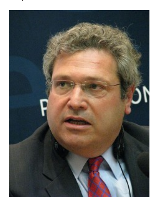
Prominent neocon intellectual Robert Kagan.

In some European circles, the neocons are described as "Israel's American agents," which may somewhat overstate the direct linkage between Israel and the neocons although a central tenet of neocon thinking is that there must be no daylight between the U.S. and Israel. The neocons say U.S. politicians must stand shoulder to shoulder with Israel even if that means the Americans sidling up to the Israelis rather than any movement the other way.