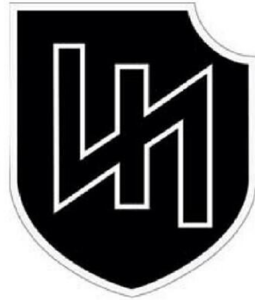
Emblem of the SS Division Das Reich.

To put aside the irony and cynicism from the previous paragraph as it is not appropriate for a situation in which the people of Ukraine are suffering and whose lives are falling apart in a thousand ways since 2014. However, how to hide the disappointment from the crocodile tears that are shed over the fate of Ukraine by those who, in fact, have been constantly pushing Ukrainians into the war since 2014?