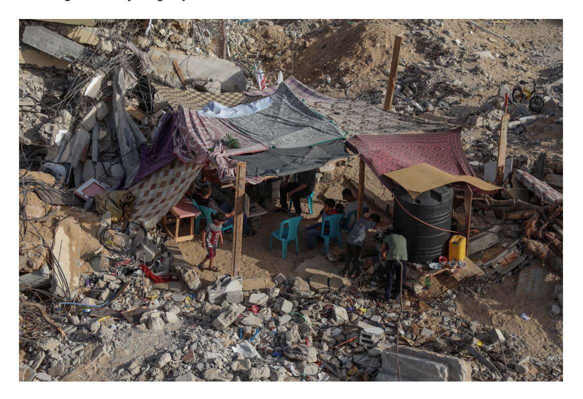
The 15-year Israeli blockade of Gaza has devastated its economy

In easing the economic pressures on the Gazan economy by allowing some of its citizens to work in Israel, the theory goes, the uneasy peace following Israel's devastating military onslaught in May might just hold.