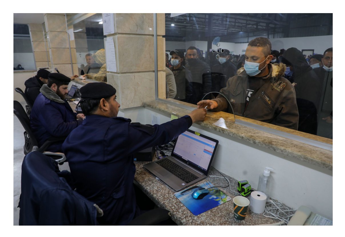
Guards check documents at the Beit Hanoun crossing