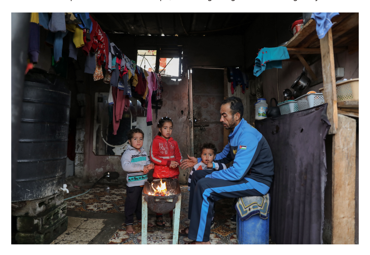
As a result of Israel's restrictions, two-thirds of the Gaza population were food insecure by the beginning of 2022

In 2012, Cogat was forced to release a 2008 document that detailed Israel's "red lines" for "food consumption in the Gaza Strip", following a legal battle brought by Gisha.