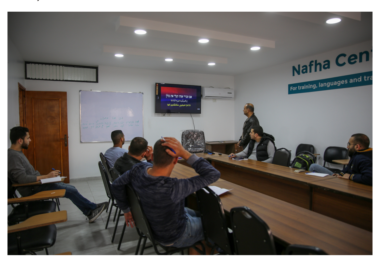
Men attending Hebrew courses in Gaza in the hope of getting permits to work doing menial jobs in Israel

He and dozens of others are attending Hebrew courses in Gaza in order to be able to communicate with their employers in Israel. Meanwhile, hundreds of other young men, mostly university graduates, attend the courses in the hope of getting permits to work doing menial jobs in Israel.