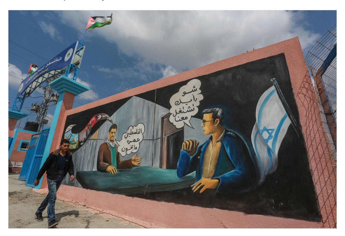
Mural near the Beit Hanoun crossing between Gaza and Israel which reads 'What do you think about working for Israel?', with the response 'The Palestinian is not a traitor'