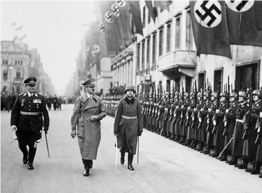
Hitler Returning in Triumph to Berlin After Reunification with Austria

By the late 1930s Hitler had resurrected Germany, which had become newly prosperous under his rule, and he had also managed to reunite it with several separated German populations. As a result, he was widely recognized as one of the most successful and popular leaders in the world , and he hoped to finally settle the Polish border dispute, offering concessions far more generous than any of his democratically-elected Weimar predecessors had ever considered. But Poland's dictatorship instead spent months rejecting his attempts at negotiations and also began brutal mistreatment of its German minority, finally forcing Hitler into declaring war. And as I discussed in 2019 , provoking that war may have been the deliberate goal of certain powerful figures.