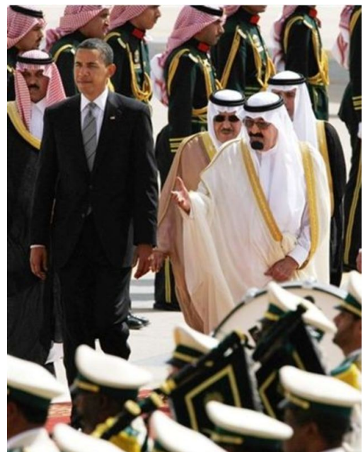
Obama with Saudi King Abdullah, 2010

The wealth of the two nations, America and Saudi Arabia, has become ever more interdependent. This is ironic. In the words of a leaked US cable, “Saudi donors remain the chief financiers of Sunni militant groups like Al Qaeda.” 25 The Rabita or Muslim World League, launched and largely funded by the Saudi royal family, has provided an international meeting place for international Salafists including some al Qaeda leaders. 26