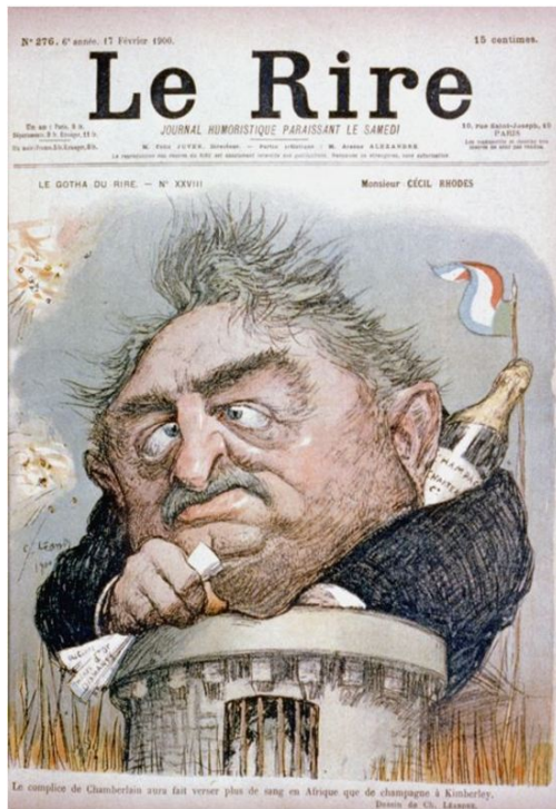
(Image: French caricature of Rhodes, showing him trapped in Kimberley during the Boer War, seen emerging from tower clutching papers with champagne bottle behind his collar.)

In 1895, after direct plotting with the uitlanders failed, Rhodes, in his capacity as Prime Minister of the British Cape Colony, sponsored an invasion of Transvaal with the so-called Jameson Raid, a mixed band of Mounted Police and mercenary volunteers. The raid was not only a failure, but a scandal: Rhodes was forced to resign as Prime Minister and his brother went to jail. The details of the Jameson raid and resulting Boer War are too complex to be recounted here; but the end result was that after the Boer War the goldfields fell largely into the hands of Rhodes.