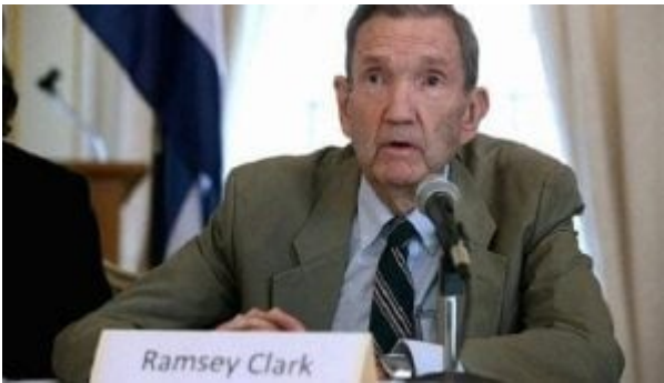
Image on the right: Ramsey Clark was renowned for being a strong advocate in defense of people at disadvantage against the U.S. establishment at home and abroad.

Former US Attorney General Ramsey Clark , son of a Supreme Court Justice understood all this genocidal mayhem as having nothing to do with any American democracy or democratic system: