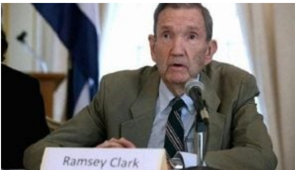
Image on the right: Ramsey Clark was renowned for being a strong advocate in defense of people at disadvantage against the U.S. establishment at home and abroad.

Former US Attorney General Ramsey Clark, son of a Supreme Court Justice understood all this genocidal mayhem as having nothing to do with any American democracy or democratic system: