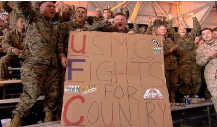
US Marines: Ultimate Fighting

You will see, more or less, just what this newest form of 'Violence as Sport' has given us. So, the same young men (and some women) who grew up on violent video games, and then graduated to UFC, make a great source for this new empire's army of warriors . I am not taking away from the super physical abilities of those who fight in those caged rings, taken right out of Spartacus . Just as with professional boxers and athletes from all sports, these folks are dedicated and train very hard. It is just that to celebrate violence is NOT what we humans are supposed to have evolved out of, and not back into.