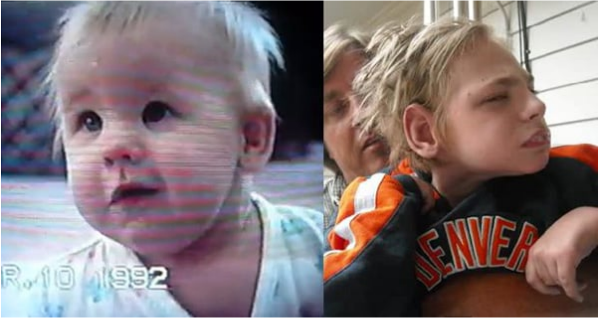
Another innocent victim of vaccine damage: