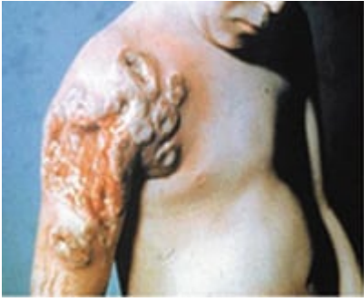
Another severe skin reaction following vaccination: