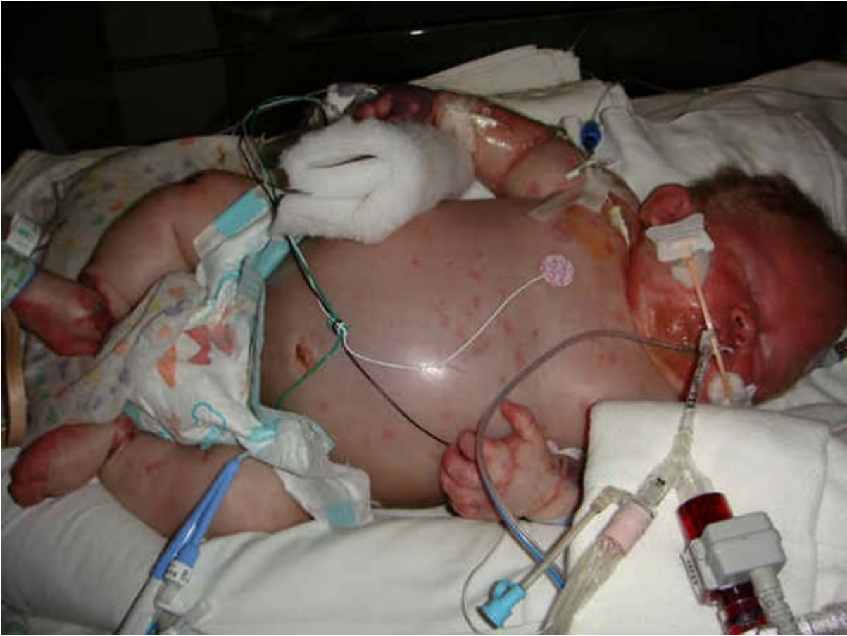
A horrifying reaction to the BCG vaccine: