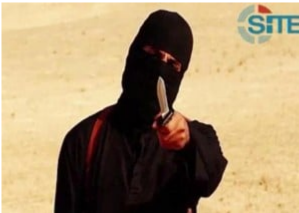
IMAGE: 'The SITE of Terror' - ISIS terror video presenter Jihadi John propagandized by the terror watchdog group SITE.