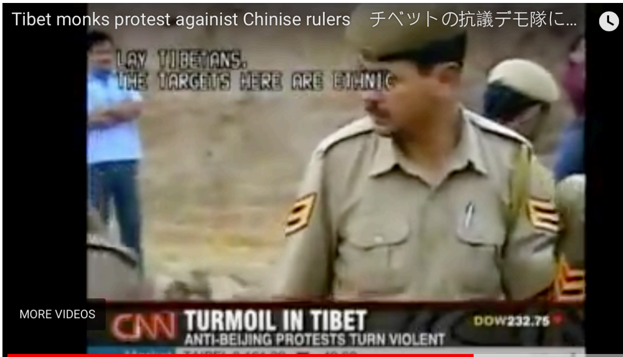
Screenshot from above CNN video

Alleged Chinese cops in khaki uniforms repressing Tibet demonstrators in China, CNN, March 14, 2008 1'38", 1'40" (image above)