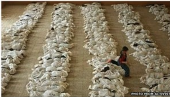
This image - which cannot be independently verified - is believed to show the bodies of children in Houla awaiting burial

The photograph was actually taken by Marco di Lauro in Iraq in 2003