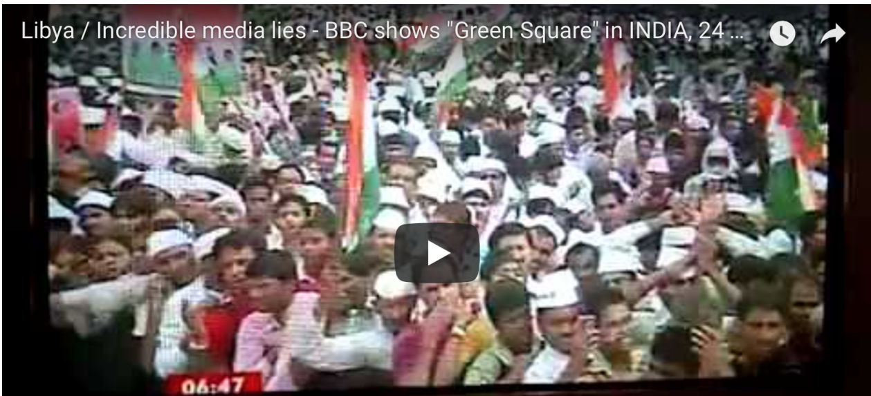
Screenshot of the above video

NATO bombing is intended to save civilian lives under The Alliance's R2P mandate. But the realities are otherwise: the civilian population is being terrorized by the NATO sponsored rebels.