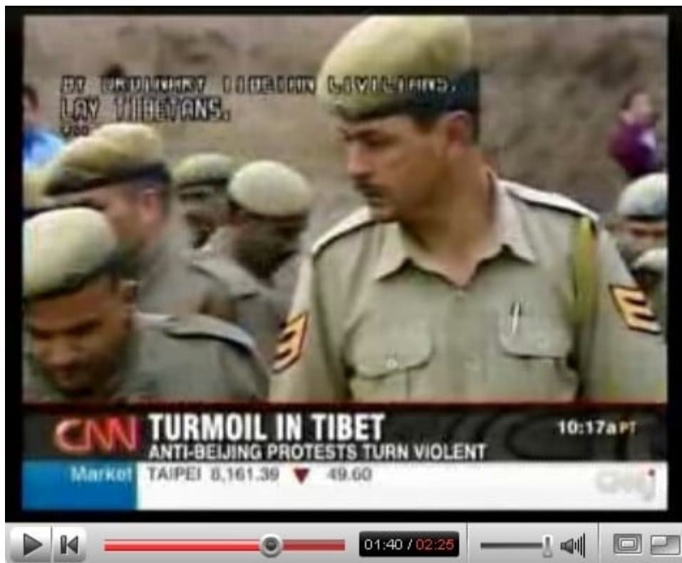
Alleged Chinese cops in khaki uniforms repressing Tibet demonstrators in China, CNN, March 14, 2008 1'40"

Their khaki uniforms with berets seem to bear the imprint of the British colonial period.