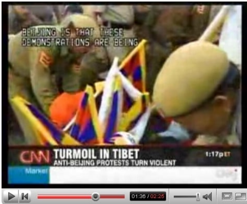
Alleged Chinese cops repressing Tibet demonstrators in China , CNN, March 14, 2008 1'36"