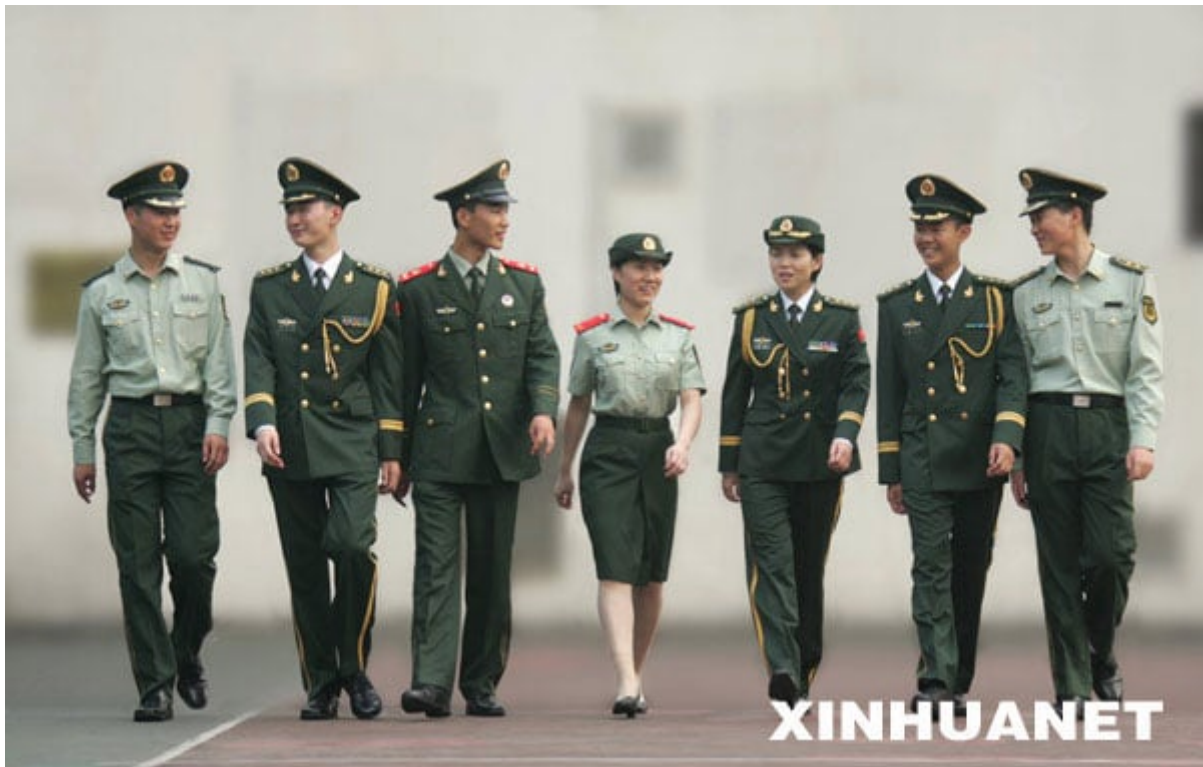
No khaki uniforms in China. These are the uniforms of China’s “Armed Police”.

The uniforms of the alleged (fake) Chinese cops displayed in the CNN report do not correspond to those used by the police in China. (See photograph below, real Chinese cops)