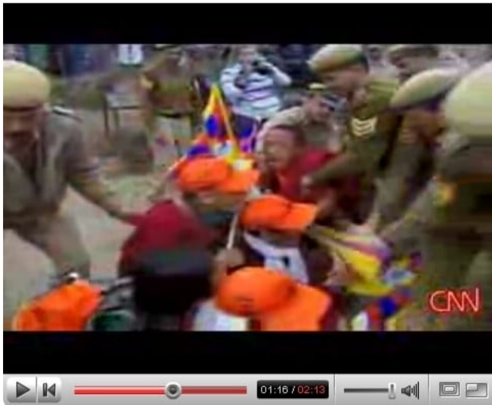
Indian cops repressing Tibet demonstrators in Himachal Pradesh, India CNN, March 13, 2008, 1'.18"