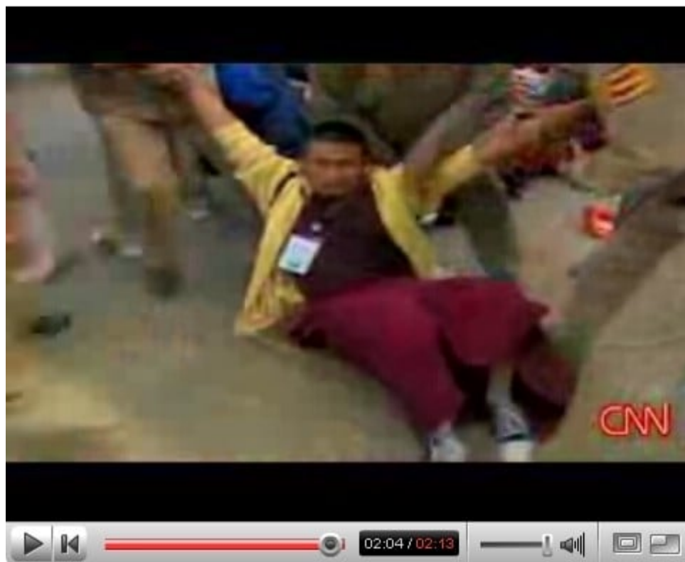
Indian cops repressing Tibetan demonstrators in Himachal Pradesh, India CNN, March 13, 2008 2.04"

The CNN's March 14 report on the Tibet Protest movement in China shows Chinese cops in khaki uniforms, yellow lapels and berets.