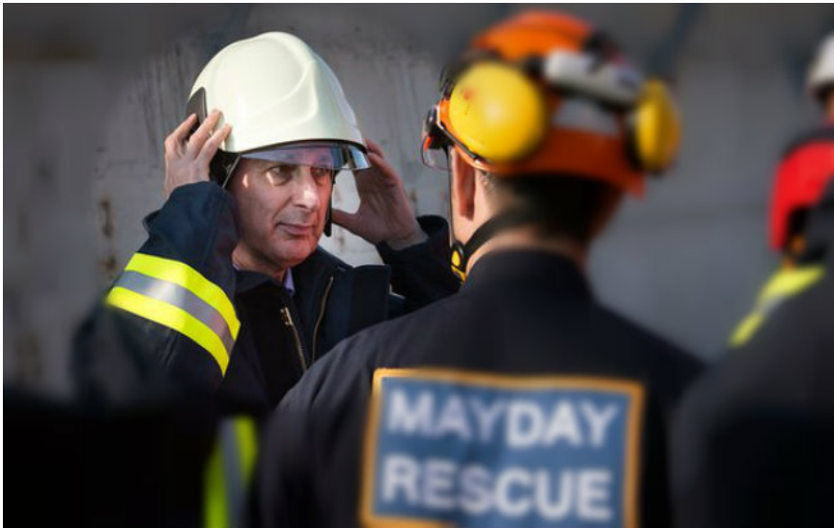
Phillip Hammond, UK Foreign Secretary meeting White Helmets in southern Turkey

The White Helmets are perhaps being demonstrated to be the most crucial component of the US and NATO shadow state building inside Syria. Led by the US and UK this group is essential to the propaganda stream that facilitates the continued media and political campaign against the elected Syrian government and permits the US and NATO to justify their regime of crippling economic and humanitarian sanctions against the Syrian people.