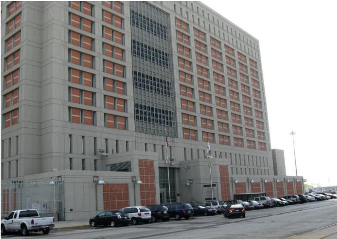
Metropolitan Detention Center in Brooklyn where Jeffrey Epstein was killed.