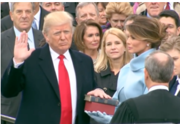
President Donald Trump being sworn in on

One of the bitter ironies here is that Trump's critics correctly noted that his thin-skinned temperament made him unfit to possess the nuclear button, but they are now egging him into a mano-a-mano confrontation with Putin. If Trump doesn't get the better of Putin in every situation, Trump will face renewed pummeling for "selling out" to the Russians.