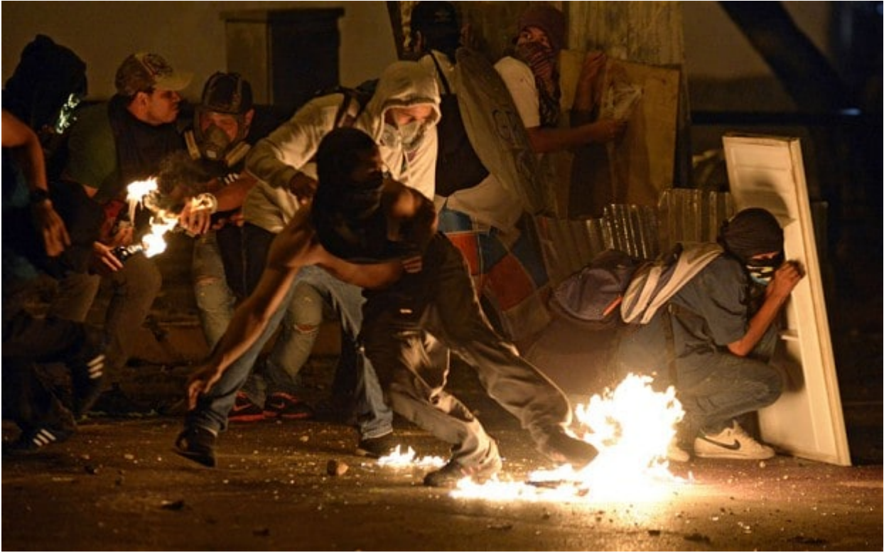
Guarimbas throwing petrol bombs - 'Molotov cocktails'

The Supreme Court was set on fire, lots of government buildings have been destroyed - all by the supposed 'victims'.