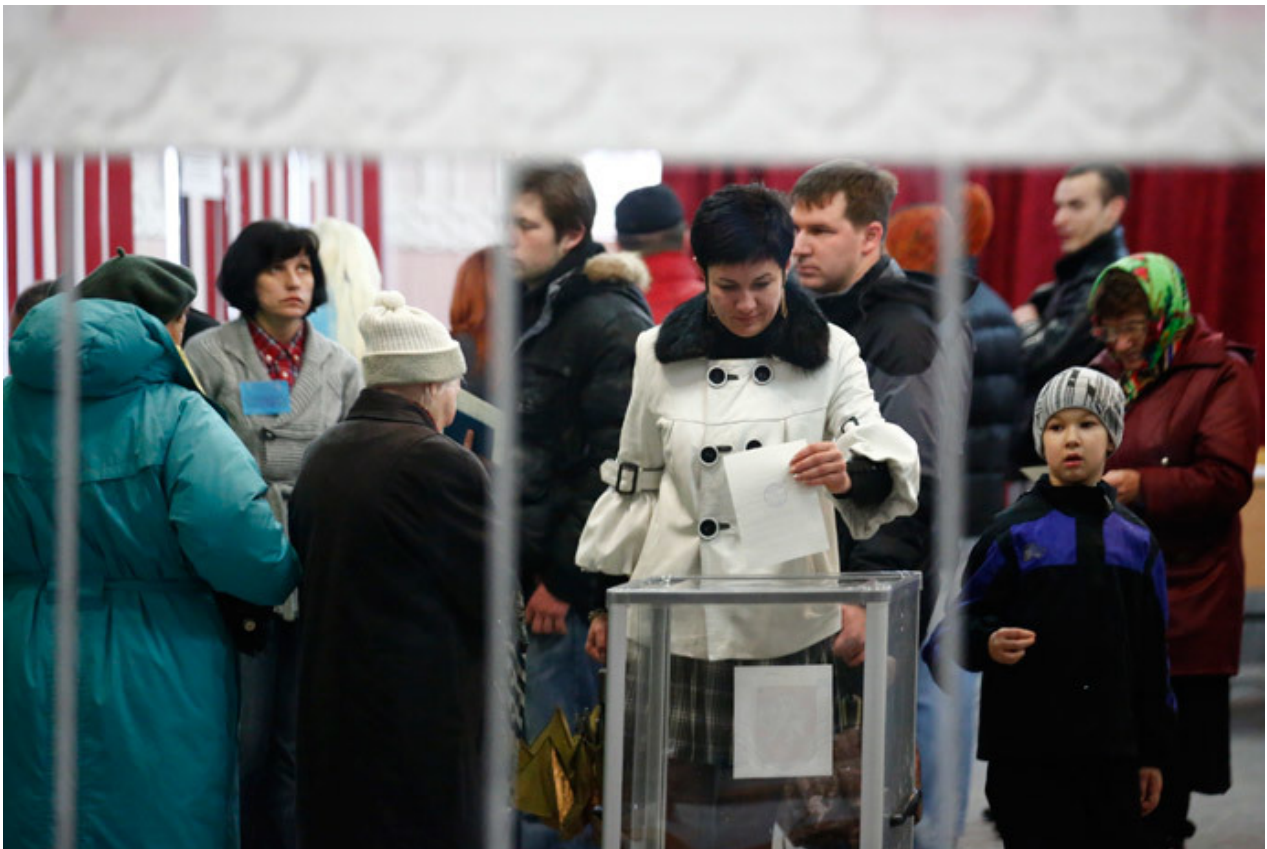
A woman is reflected in a mirror as she casts her ballot during voting in a referendum at a polling station in Simferopol March 16, 2014.