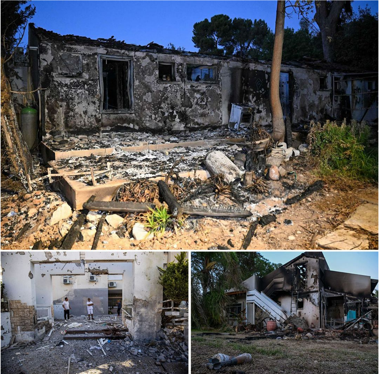
Aftermath of Be'eri Kibbutz after the fire power of the two sides ceased