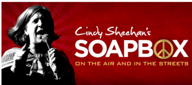
Cindy Sheehan's Soapbox July 7, 2019