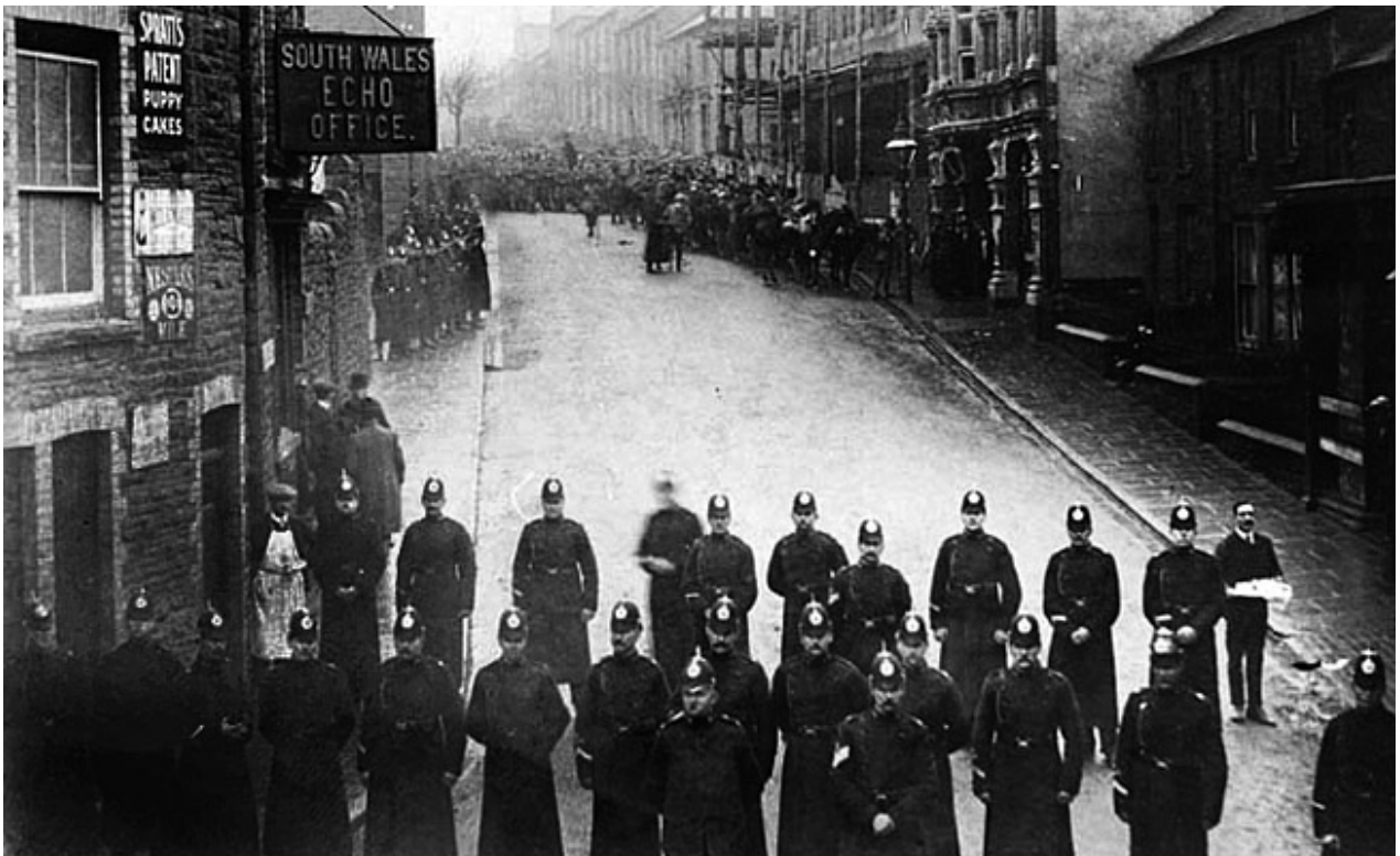
Police blocking streets during Tonypandy riots.

Appointed Chancellor of the Exchequer during the late 1920s, Churchill opposed social reforms that would have benefited the poor while promoting ideas advanced by top bankers—backed by Montague Norman, Governor of the Bank of England—who wanted to prevent any drift of the British Empire.