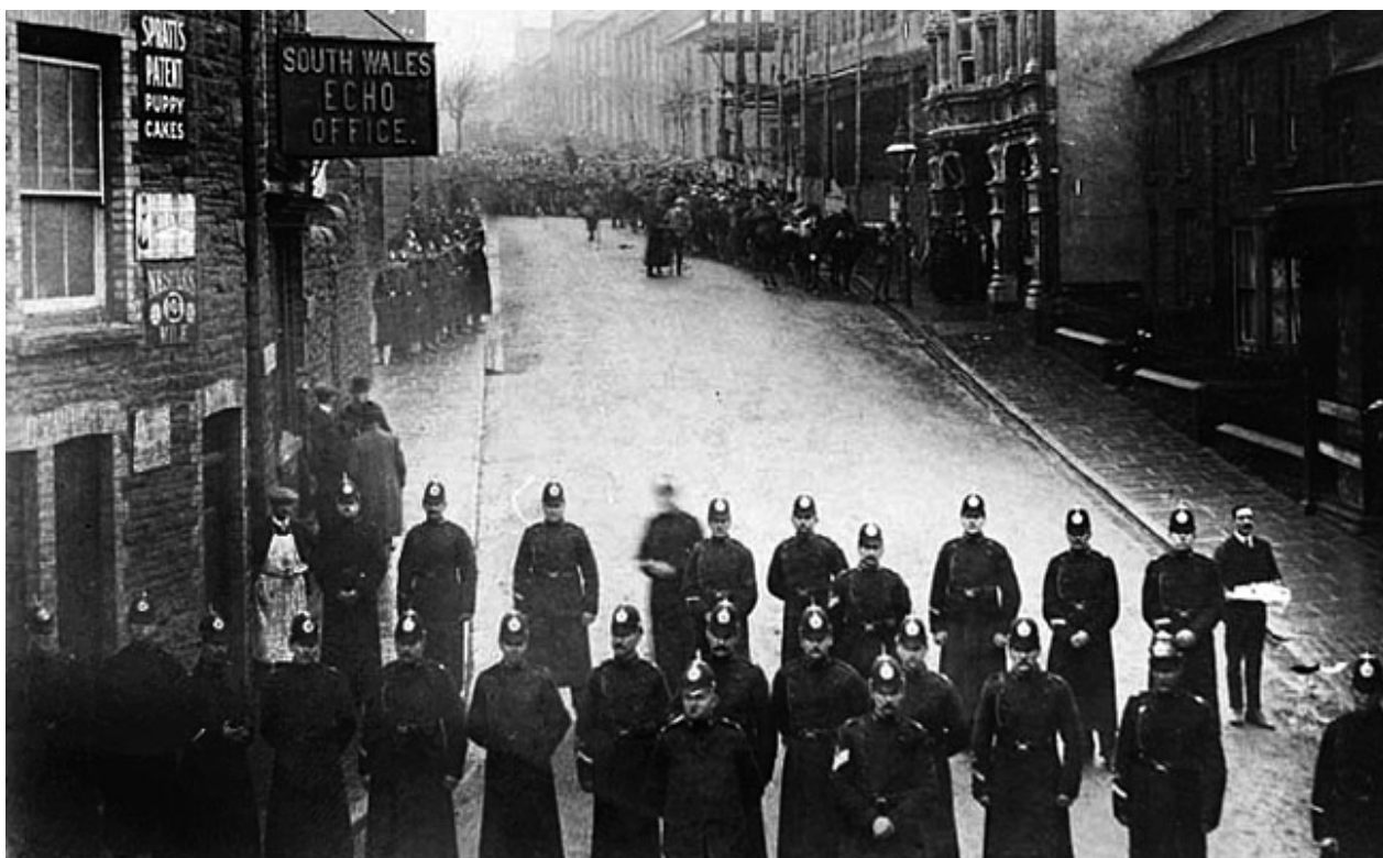
Police blocking streets during Tonypany riots.

Appointed Chancellor of the Exchequer during the late 1920s, Churchill opposed social reforms that would have benefited the poor while promoting ideas advanced by top bankers—backed by Montague Norman, Governor of the Bank of England—who wanted to prevent any drift of the British Empire.