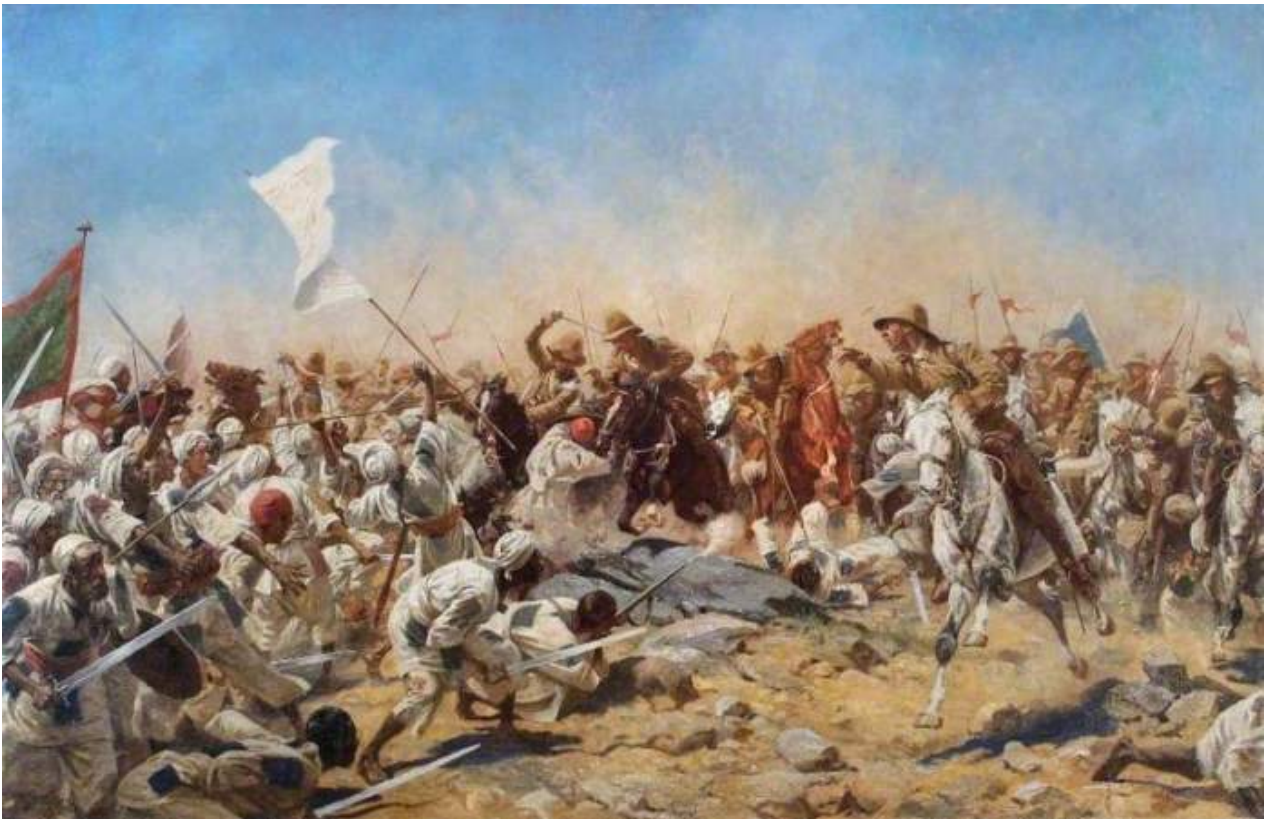
Battle of Omdurman and the British conquest of Sudan.

The battle was not so glamorous for the Sudanese, however, who lost 10,000 men and had 5,000 more taken prisoner.