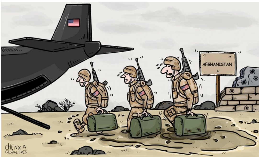
Afghanistan withdrawal by the Pentagon portrayed in Global Times

Clearly then, Bin Laden and his cohorts had reasons to be angry, though this does not for a moment condone their terrorist activities which often deliberately targeted civilians. In November 2002 Bin Laden predicted the US would suffer a “military defeat” in Afghanistan and that they would be forced to withdraw from the country, which is what unfolded 10 years after Bin Laden’s death.