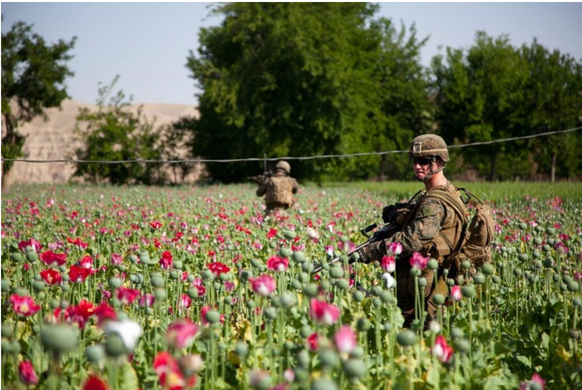
U.S. troops guarding an opium poppy field in Afghanistan.

The terrorist attacks of 11 September 2001 (9/11) against America enabled the White House to increase the expansionist goals of the country’s foreign policy. Zbigniew Brzezinski, the former US National Security Advisor, wrote that Japan’s bombing of Pearl Harbor had united the American public behind the nation’s entry into the Second World War; just as the 9/11 atrocities led to significant support in America for military action abroad.