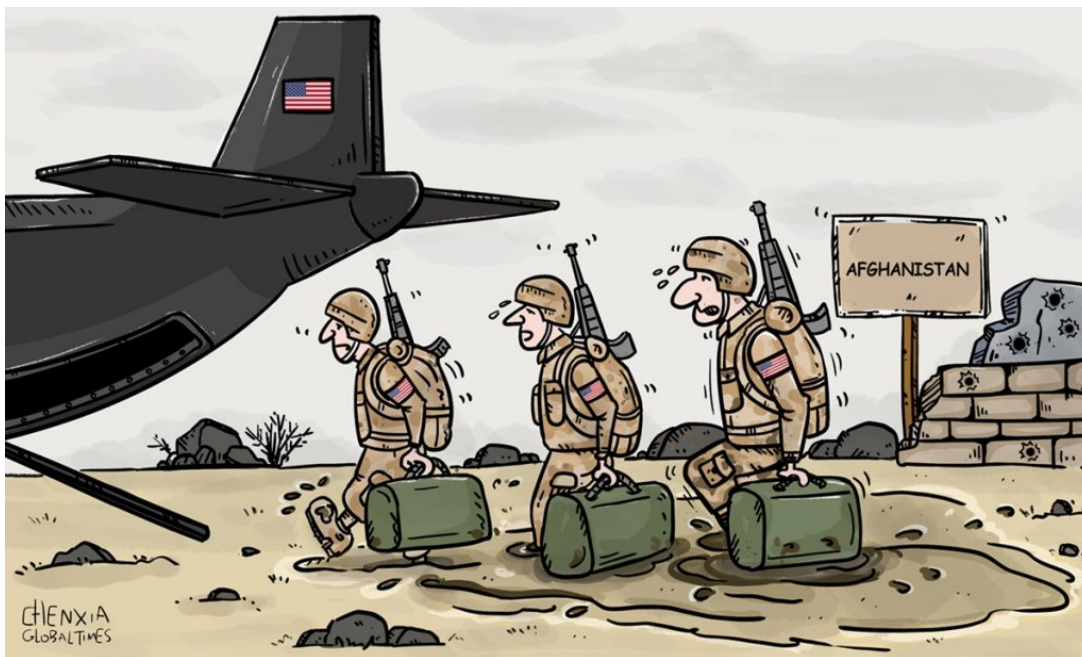
Afghanistan withdrawal by the Pentagon portrayed in Global Times

Clearly then, Bin Laden and his cohorts had reasons to be angry, though this does not for a moment condone their terrorist activities which often deliberately targeted civilians. In November 2002 Bin Laden predicted the US would suffer a “military defeat” in Afghanistan and that they would be forced to withdraw from the country, which is what unfolded 10 years after Bin Laden’s death.