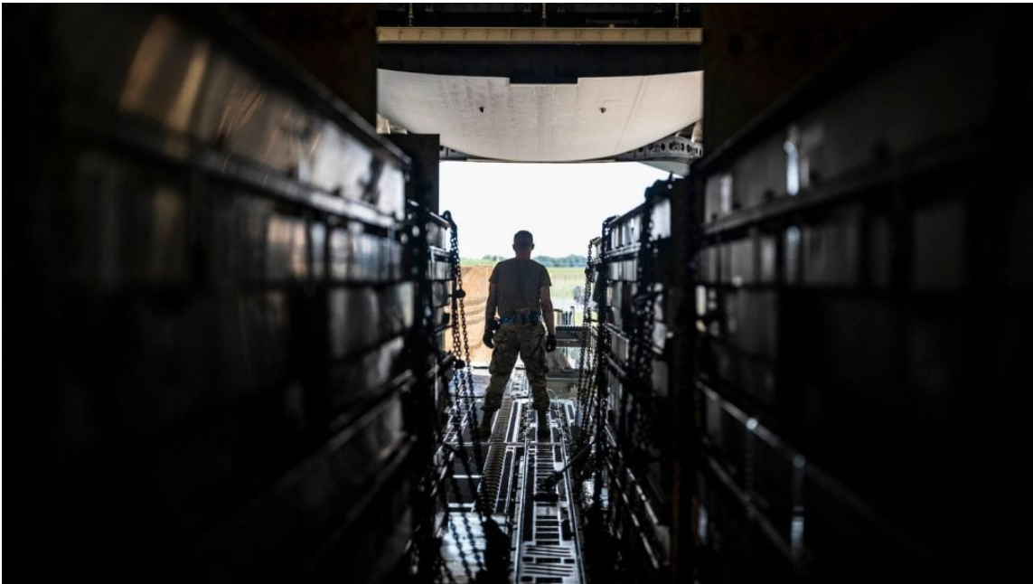
An airman loads weapons cargo bound for Ukraine onto a C-17 Globemaster III during a security assistance mission at Dover Air Force Base, Delaware, Sept. 14, 2022.

the U.S. and other NATO nations on a ten-year plan to provide weapons. Joe Biden can only serve for a maximum of four and a half more years, meaning that he wants to make a commitment that a future president could not change. In so doing, he invalidates the concerns of voters in this country and of the people who are supposed to represent them.