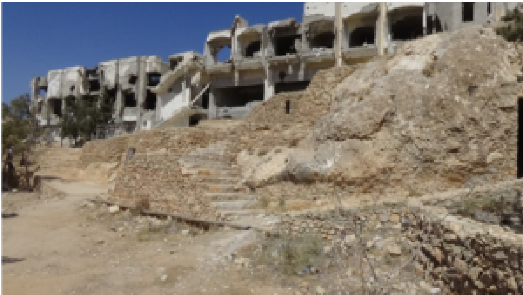
(former al Nusra Front/al Qaeda Headquarters, Masloula Syria, 2016.)

Importantly, Eastern Orthodox Christianity is also being persecuted and expunged from modern-day Ukraine since Washington installed a nazi-dominated coup government in 2014.(3)