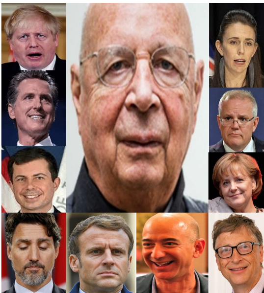
There is a reason all national leaders sound the same: they are all graduates of Schwab’s indoctrination camp for “Young Globalist Leaders”

In another WEF Davos24 session, somebody asked - “ What can we do to avoid that the wrong President is being elected? ”