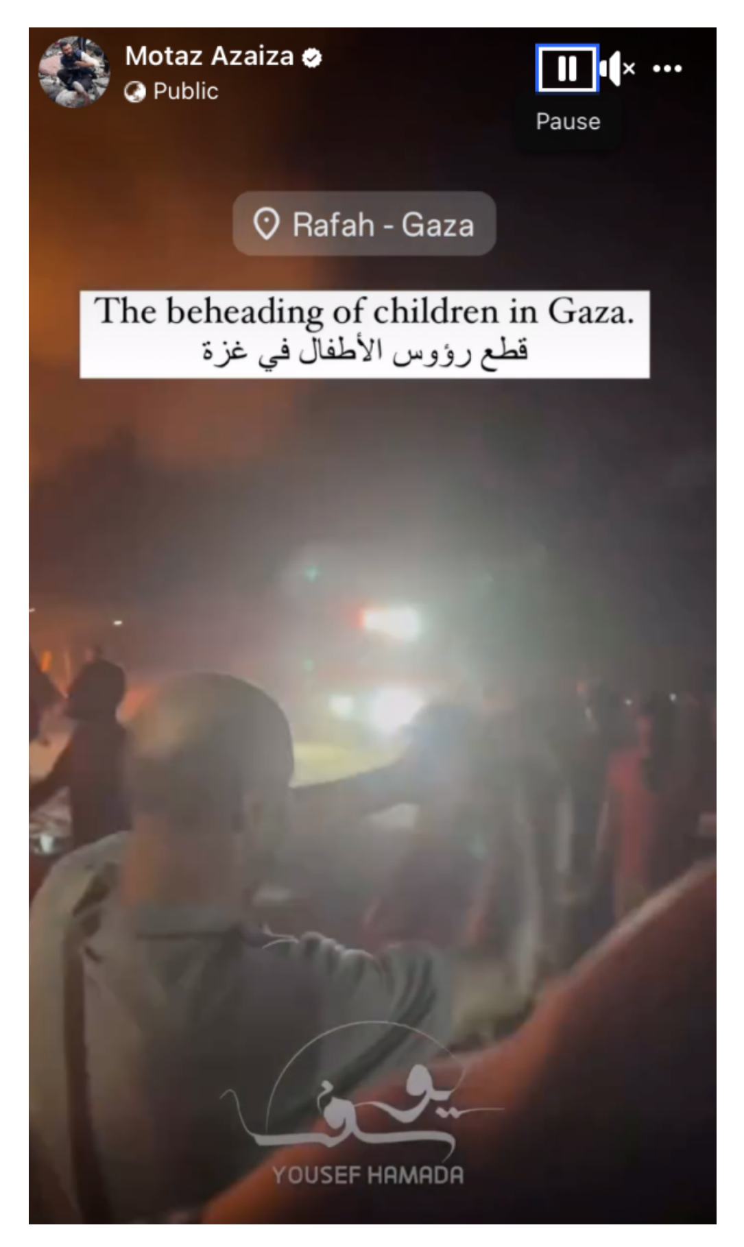
Click here to watch the video