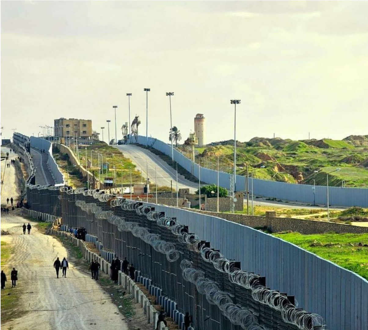
Egypt border wall

“ Hamas tunnels ” is favorite Israeli justification for bombing hospitals, mosques, schools, universities and civilian infrastructure. Now we expect it will be used to breach the border and drive the Palestinians in Egypt. Here’s more: