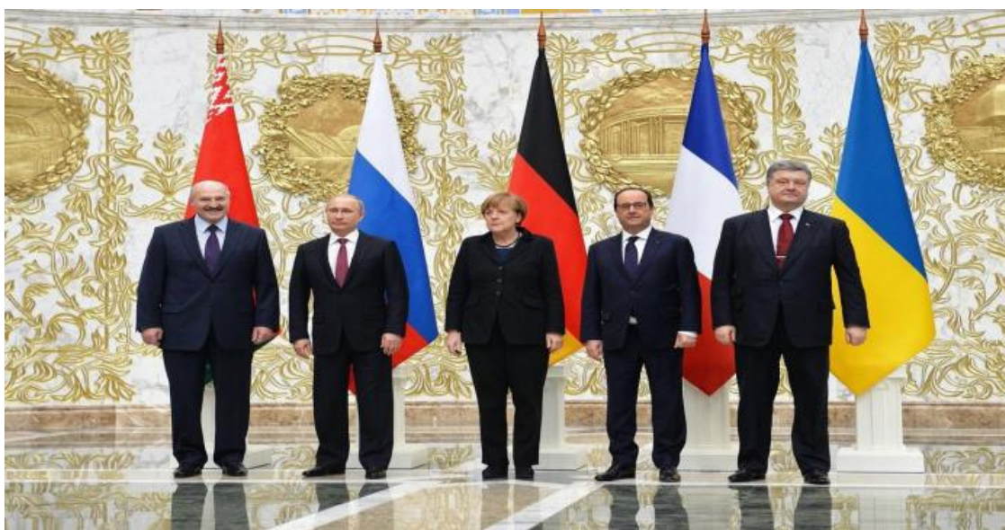
Leaders of Belarus, Russia, Germany, France and Ukraine at the February 11-12, 2015, summit in Minsk.

Putin, as well as François Hollande of France, and Angela Merkel of Germany, brought the Donbass government and the Ukraine government together in 2015 and got the Donbass and Ukraine to sign onto an agreement in Minsk, promising that those two then-warring parties would call a truce until both of them would agree to negotiate together and arrange some degree of autonomy for Donbass within the Ukrainian federation .