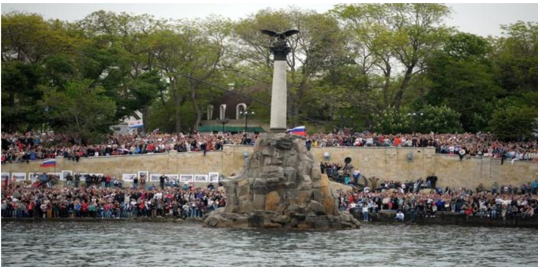
Russian Victory Day in Sevastopol, May 9, 2014.

Several of the mercenaries that the U.S. hired (some from Georgia , for example, as shown in these videos ) subsequently confessed to having participated in the coup. The U.S. afterwards charged Putin with “aggression against Ukraine,” and with “seizing Crimea,” and issued sanctions against Russia for that.