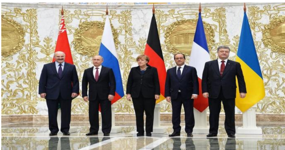
Leaders of Belarus, Russia, Germany, France and Ukraine at the February 11-12, 2015, summit in Minsk.

Putin, as well as François Hollande of France, and Angela Merkel of Germany, brought the Donbass government and the Ukraine government together in 2015 and got the Donbass and Ukraine to sign onto an agreement in Minsk, promising that those two then-warring parties would call a truce until both of them would agree to negotiate together and arrange some degree of autonomy for Donbass within the Ukrainian federation .