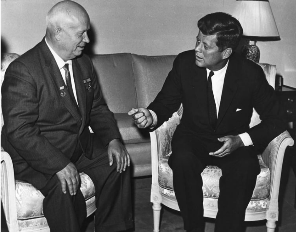
PX 96-33:12 03 June 1961 President Kennedy meets with Chairman Khrushchev at the U. S. Embassy residence, Vienna.

After President Johnson destroyed himself in the military/security complex's Vietnam War, President Nixon renewed the tension reducing policy of President Kennedy. The Strategic Arms Limitations Talks (SALT) and arms limitations agreements followed. President Nixon topped them off by opening to China and replacing that tense relationship with the "one China" policy. This was again too much for the US military/security complex, and they orchestrated with the Washington Post the "Watergate" scandal to remove him from office.