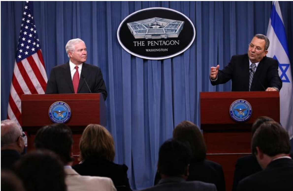
Robert Gates and Israel's Minister of Defense Ehud Barak, Press Conference, April 27, 2010