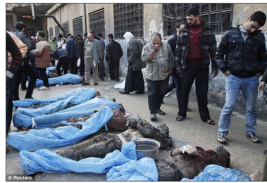
Chemical attacks in Hama, although it kills the bodies of Syrian fighters that are thought to have been the victims of Syria's city of Hama today