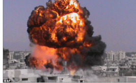
Video shows an explosion in the Syrian city of Hama last month. It has been now been reported that the U.S. backed plan to launch chemical weapons in Syria would be blamed on Assad's regime