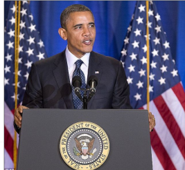
Barack Obama (Obama) said during a speech last month that if Syria used 'lethal' weapons against its own people it would be 'totally unacceptable'