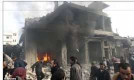
Deceased Syrian soldiers in a site hit by rebel attacks, which was reported by a Syrian Air Force fighter jet from Hama to Assad, after the end of the month of August 12 A leaked U.S. government cable revealed that the Syrian army more than likely had used chemical weapons during an attack in the city of Hama in December. The document, revealed in The Cable, revealed the findings of an investigation by Scott Frazier, leader of the U.S. congressional intelligence, who accuses that the Syrian army used chemical weapons in the December 23 attack.