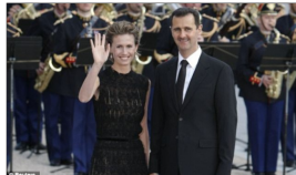
Speaker Leon Panetta (Panetta) said that the report was a 'totally unacceptable' chemical weapons and that Assad would never use them against citizens

Eye witness accounts from the investigation revealed that a rebel-borne chemical weapons and Assad's people thought to them to suffer injuries, vomiting, abdominal pain, dizziness, slurred, and respiratory distress. The symptoms suggest that the weaponized compound Agent 12 was responsible. Syria denied using chemical weapons and said it would never use them against citizens. Speaking to Pentagon reporters at the time, Defense Secretary Leon Panetta said his biggest concern was that the U.S. and its allies would use the chemical and biological weapons that scattered across Syria and ensure the components don't end up in the wrong hands if the regime falls, particularly under rebel command.