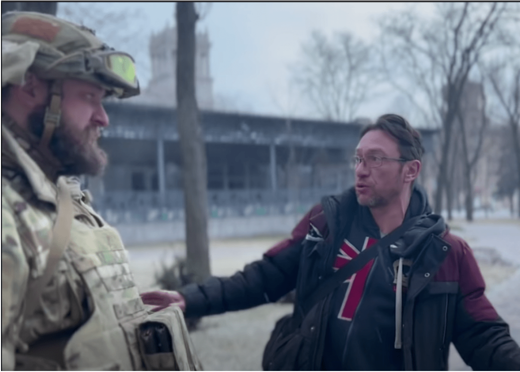
Azov soldier (L) appears on March 11 with a local man outside the Mariupol theater

Since Russia launched its invasion, Azov Battalion soldiers have been filmed preventing civilians from leaving Mariupol – even forcing men out of their cars and brutally assaulting them while they attempted to break through the paramilitary’s checkpoints. If testimony from many Mariupol residents was to be believed, Azov had used many of them as human shields.