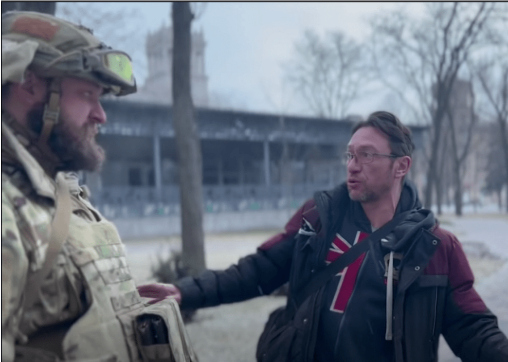
Azov soldier (L) appears on March 11 with a local man outside the Mariupol theater

Since Russia launched its invasion, Azov Battalion soldiers have been filmed preventing civilians from leaving Mariupol – even forcing men out of their cars and brutally assaulting them while they attempted to break through the paramilitary’s checkpoints. If testimony from many Mariupol residents was to be believed, Azov had used many of them as human shields.