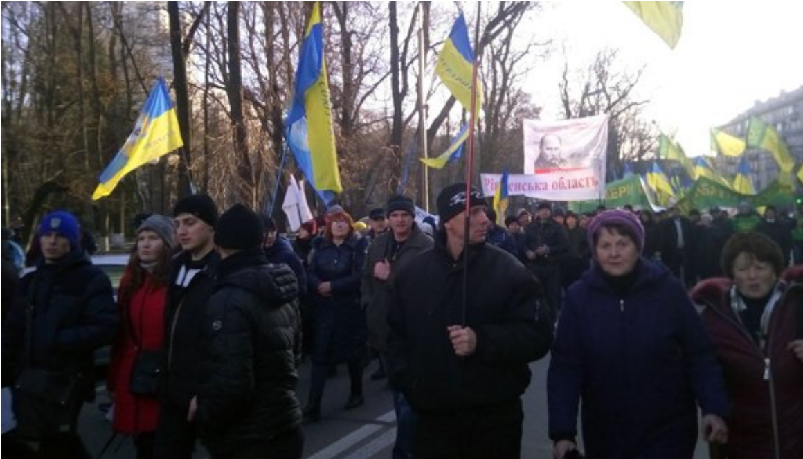
Ukrainians protest privatization of land in December 2020.

Even amid the pandemic there has been “wide-ranging opposition from the Ukrainian public to reversing that ban, with over 64 percent of the people opposed to the creation of a land market, according to an April 2021 poll.” [3]