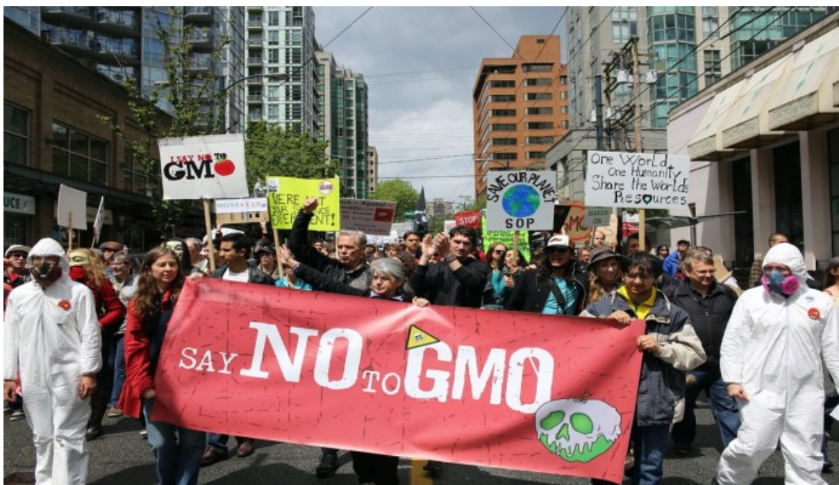
March against Monsanto in Vancouver in 2013.

They exposed the government agencies' revolving door—an arrangement whereby the giant agriculture and pharmaceutical corporations place their hirelings onto U.S. regulatory boards such as the Food and Drug Administration. Monsanto's lackeys in government write their own laws and block even tepid demands for labeling of GMO products, at Monsanto's behest. [33]