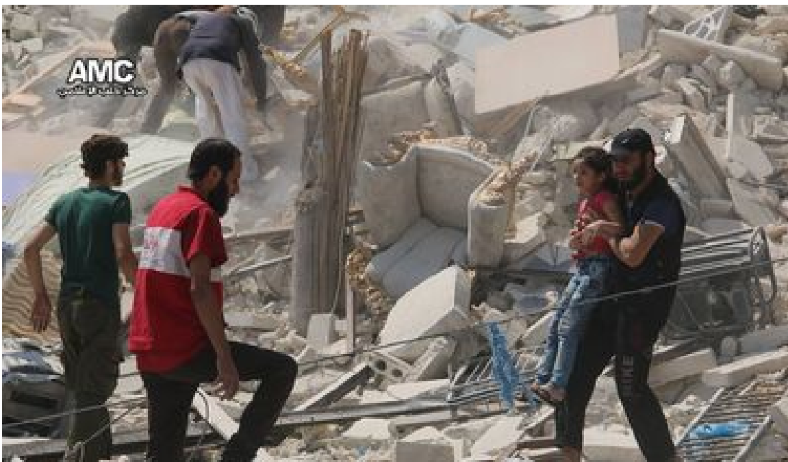
MAN CARRIES CHILD, MEN LOOKING BUSY: A familiar emotive and staged image, generated by Aleppo Media Centre (Source: AMC/Washington Times )

Whether it is Omran’s story or the recent claims of the use of chlorine bombs by the Syrian Army, they all serve an agenda that has little to do with benefitting the country of Syria, and much more to do with furthering the US-NATO’s own stated regime change policy objectives that have been at the top of their Syria to-do list since well before 2011 when the current pre-planned dirty war on Syria really started to gather momentum in Washington’s nation-building [destroying] agencies.