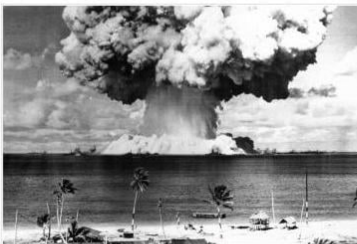
An atom bomb test explodes in Bikini Atoll.