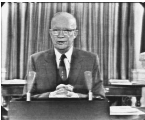
President Dwight Eisenhower delivering his farewell address on Jan. 17, 1961.

Among the 18 states enjoying a claimed economic impact of more than $100 million from the fighter jet is Vermont — which is why the F-35 gets the support even of Sen. Bernie Sanders .